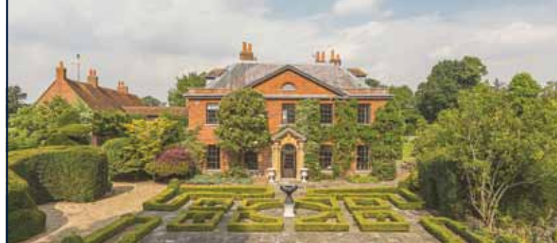
HURST, BERKSHIRE, ENGLAND

Grade II* listed \bullet dates to 1580 \bullet 6 reception rooms \bullet 12 bedrooms \bullet 10 bathrooms • 2 guest flats • further cottage • outbuildings • paddocks, woodland and ponds